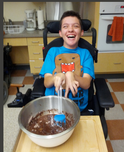
Mer having a blast making brownies.