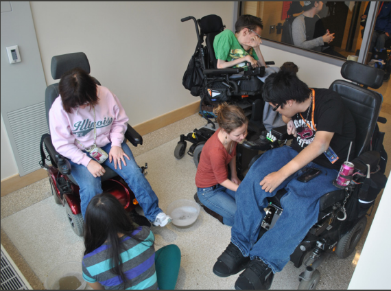
Students participating in a wheelchair wash where proceeds went to 5 baskets donated to needy families for Thanksgiving.