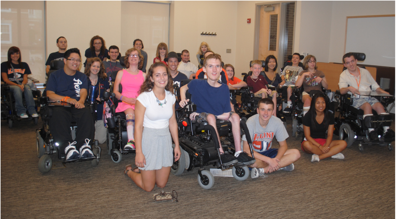
2012-13 new residents with mentors and staff.

The students speak about the transformative social learning that naturally occurs as a result of their emersion in a residential context with peers with similar abilities and needs. Finally, the newsletter concludes with the stories of our older students. As graduation approaches, the maturation that has occurred is self-evident, as the students begin to share their visions of viable and vibrant career paths, and describe for themselves a self-determined future that had been unimaginable prior to their arrival at Nugent Hall. Through their stories, the Beckwith Residential Support Services cycle of life is again revealed and I — like all DRES and Beckwith staff — experience the pride of knowing that these extraordinary success stories are only made possible by the unique facilities and services of the BRSS program nested in the state-of-the-art confines of Nugent Hall.