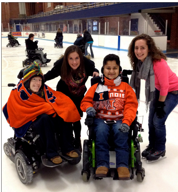
Who knew ice skating was so fun?

individuals who move into the community and there are others who transition out, but the spirit remains alive. My time to transition out of the community came when I graduated in May. I am so incredibly thankful for all of the memories that were created along the way. This spirit will forever be an important part of who I am.