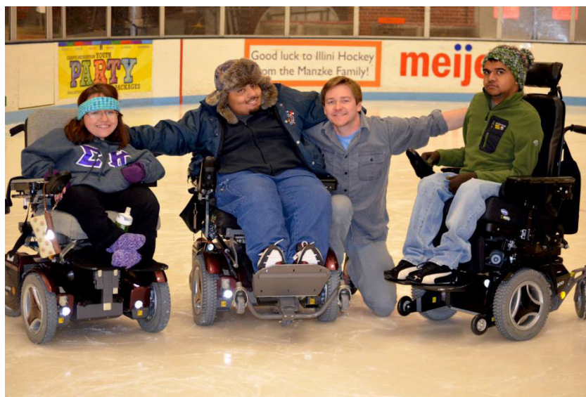
The best Reading Day study break ever—ice skating with the gang!