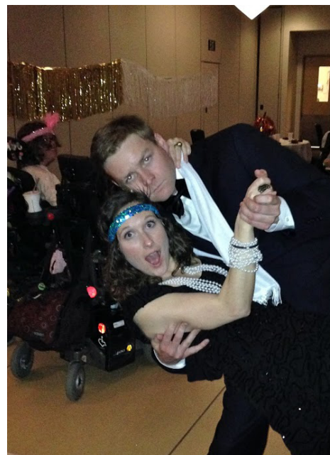
Right: The Gatsbys.