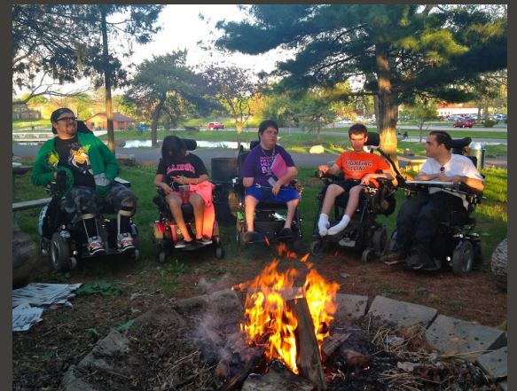
It might have been warmer and lighter the second time around, but the camaraderie was unchanged during the end-of-year bonfire.