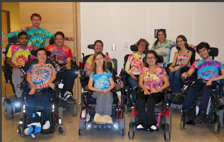
Wearing the "Fruit of the Loom" of their labor.