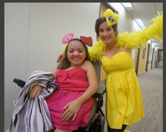
Miss Piggy and Big Bird crashing Beckwith's Halloween party.