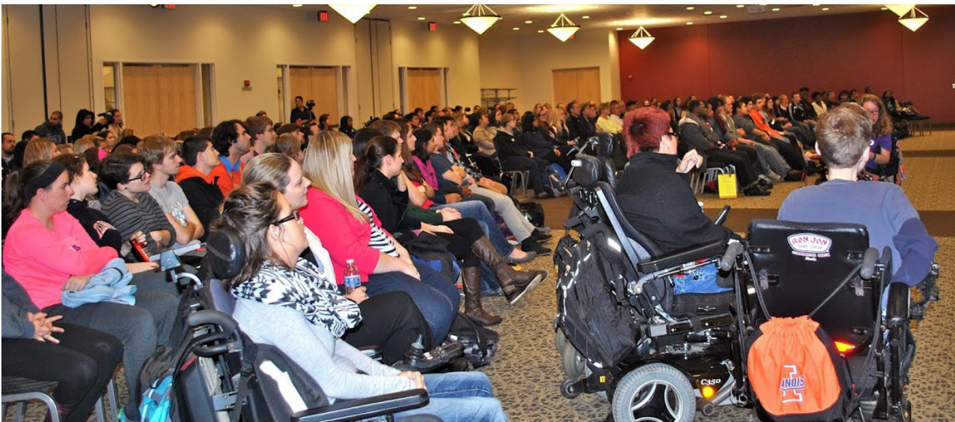
2013 Disability Awareness Attendees

Clearly, Beckwith Residential Support Services continues to be an amazingly interconnected, active, and uniquely successful community in helping students with disabilities fulfill their educational and professional goals. However, in the spirit of Ubuntu, we must acknowledge that BRSS is what it is because of the unwavering commitment of a great university to provide unparalleled access for those with the most severe physical disabilities. Indeed, we are who we are because of what the University of Illinois is!