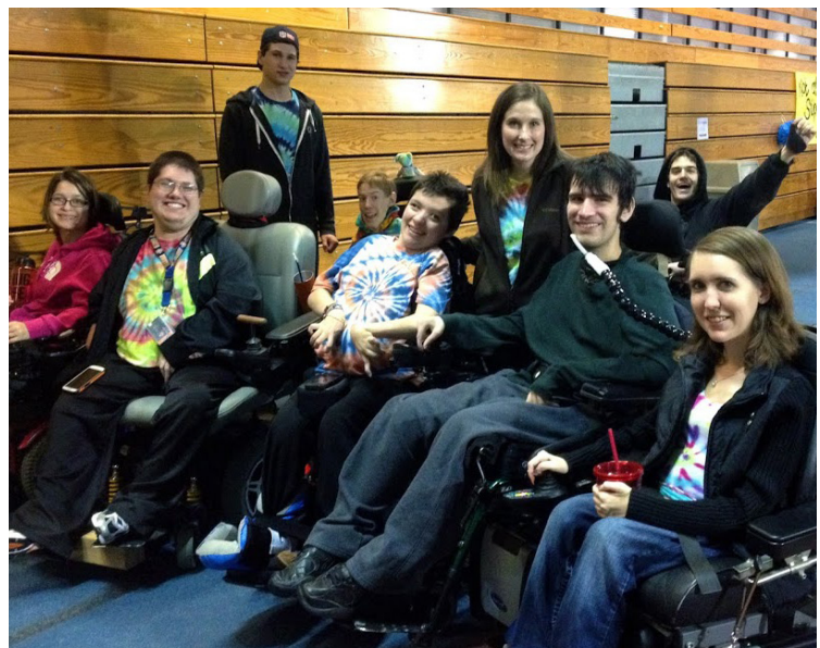
Social life: Being a part of the "Wheelies for Life" team.